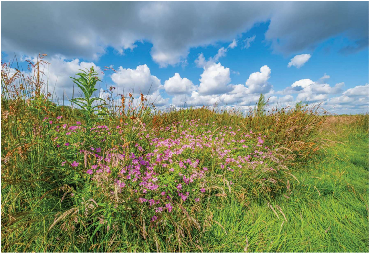
Obviously it depends on the season, but we saw plenty of wild flowers