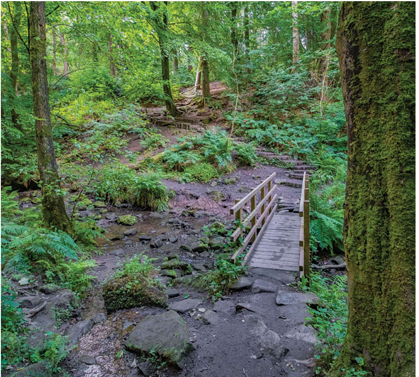
As you walk along the paths, depending on the route you take, you may come down this steep path with steps, cross over the stream, and ascend the steps the other side