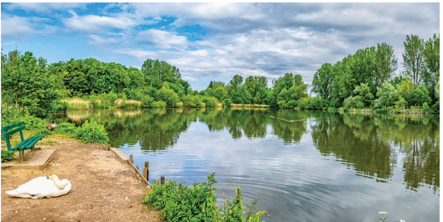
A swan sleeping by the lake