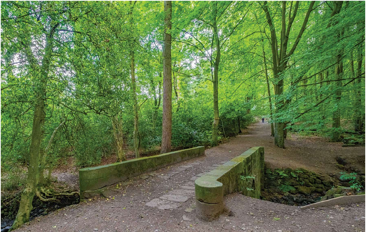
The third place we visited was a bit further north - Biddulph Grange Country Park.

For those who know it, it is next door to Biddulph Grange Gardens (run by the National Trust) and was part of the original estate. This country park has also come into the care of Staffordshire Wildlife Trust. It is in this area that the River Trent has its source. From the car park for the Country Park, paths take you past a part-time visitor centre and into the woods.