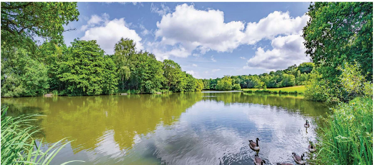
One of the paths takes you back downhill along a straight path known as 'the Mile' or 'Obelisk Walk' which ends at gates to the National Trust Gardens. I have walked up this path from the gardens side but never knew that just yards away is a small lake known as 'The Fish Pool'