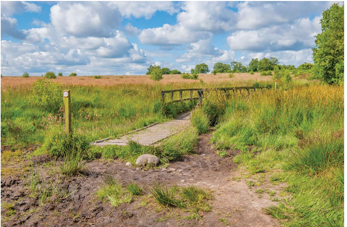
The paths can be a bit rough and, in some places, rather muddy. Fortunately, one of the worst patches has a bridge over it