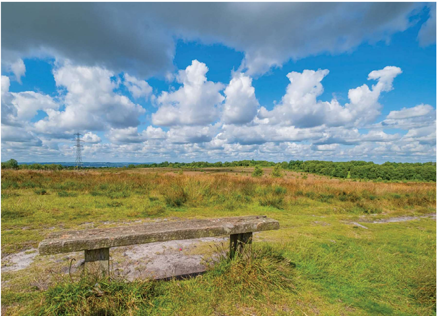
There are a few benches so that you can sit and enjoy the view