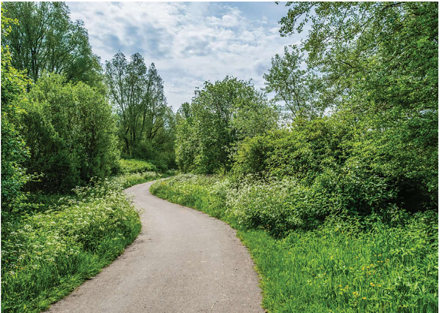
There are good paved paths through the reserve (although there are also rougher tracks)