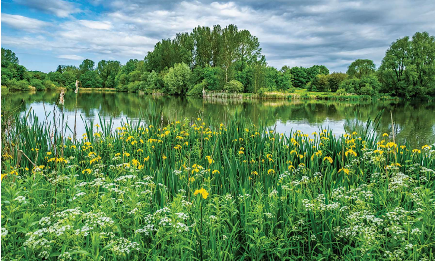
The car park is off Ford Green Road next to the Ford Green Hall museum. I must admit, driving through industrial and urban Stoke to get there made me wonder if my directions were correct. The information board at the entrance tells me that north end was a coal mine with a railway line running through the length of the reserve. There are well surfaced paths through the reserve with many paths coming in from the surrounding housing estates. Around the lake you may encounter waterfowl of different types