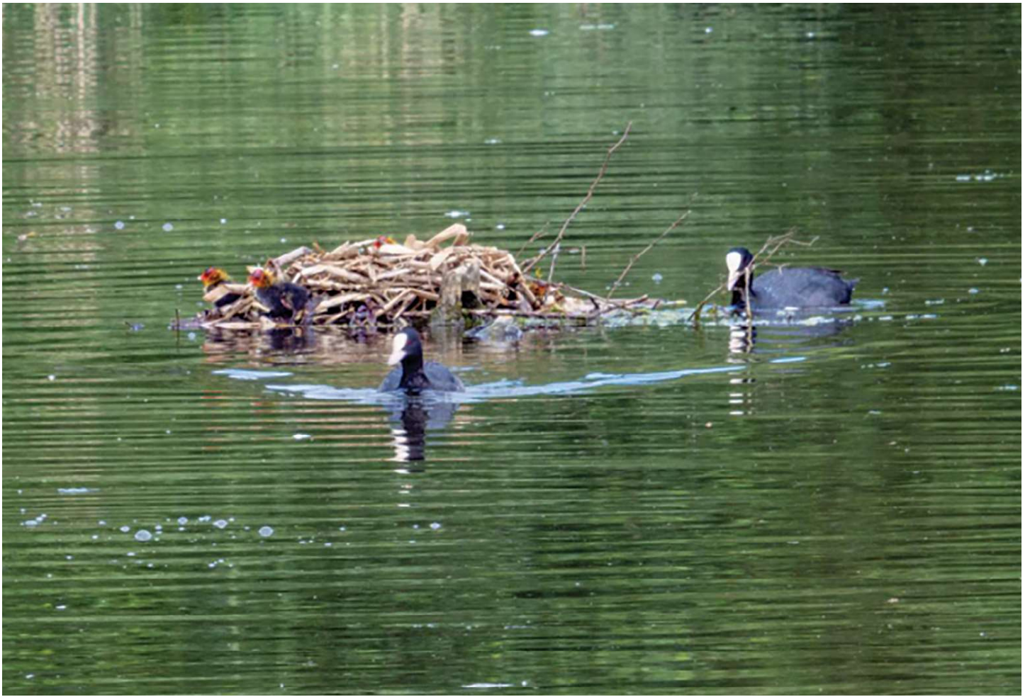
Coots nesting on the lake